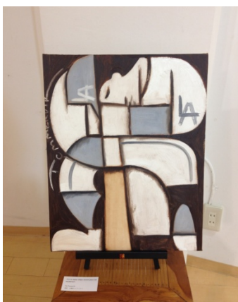
《 LA los ángeles dodgers abstract player and baseball bat 》