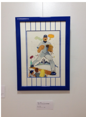
《Masahiro Tanaka ("Daily SPA!", Fusosha) 》