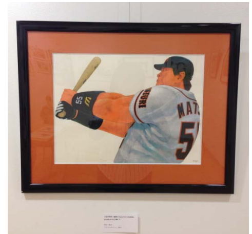
《Hideki Matsui (Number PLUS)》