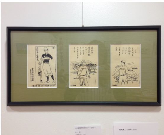
《Original post cards made by Yohizawa Baseball Museum》

He creates many baseball sketches and paintings. He has lived in New York from 1999 where he shows his artworks which often ironically merge his impressions of baseball players from his early childhood with modern imagery.