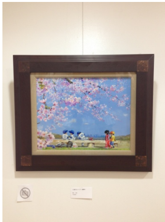
《Out of the Field