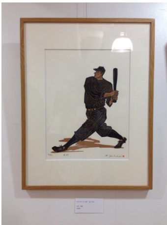
《Major Leaguer B-9》