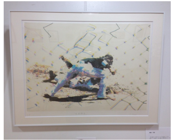
《A kinetic image》