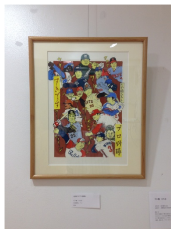
《I love Professional Baseball》