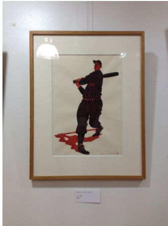
《Major Leaguer B-7》