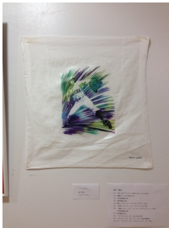
《"Prince of Handkerchief"》