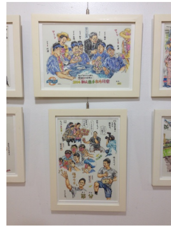
《The sketches of Japanese Professional Baseball in Urazoe Gakuen Dori》