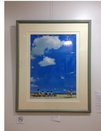
《Out of the Field Full Resistance》