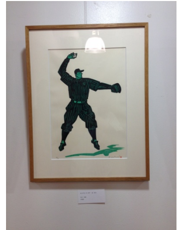
《Major Leaguer B-8》