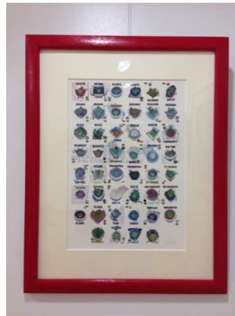
《Sports Year! 2003》